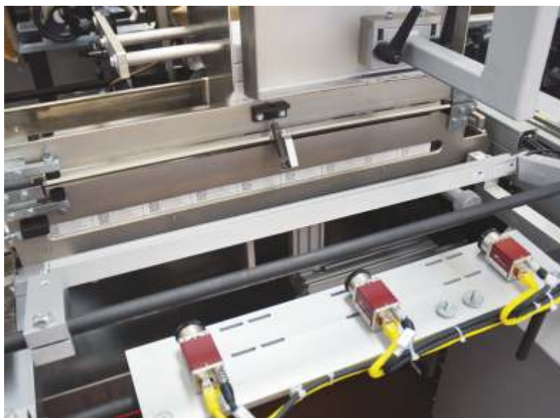
Reading traceability data on all the cartons inserted in the case-pack

Along with this integrate Track and Trace solution directly fitted inside all its machines, CAM has its new compact, fast TT station unit